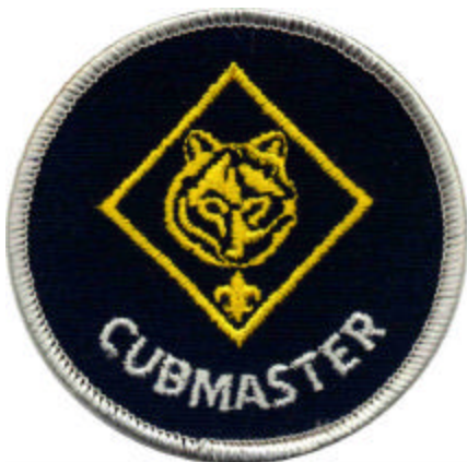
A note from the Cubmaster

of him too. Remember in every thing that you undertake, no matter how small the task may seem, to always Do Your Best and to see it through to the end.