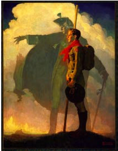
A Scout is Loyal by Norman Rockwell 1932